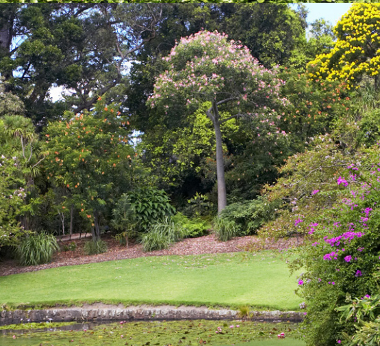
NYMPHAEA LAKE WEST